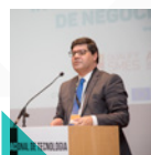
CLOSING SESSION Eurico Brilhante Dias