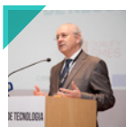
PANEL II A Portuguese Economy: Past and future Rui Rio