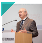
PANEL II A Portuguese Economy: Past and future Rui Rio